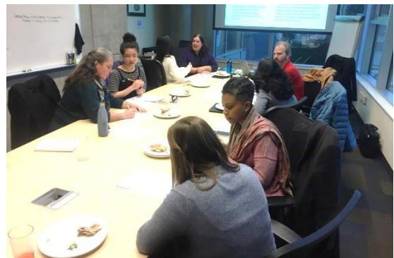
November SWG Meeting